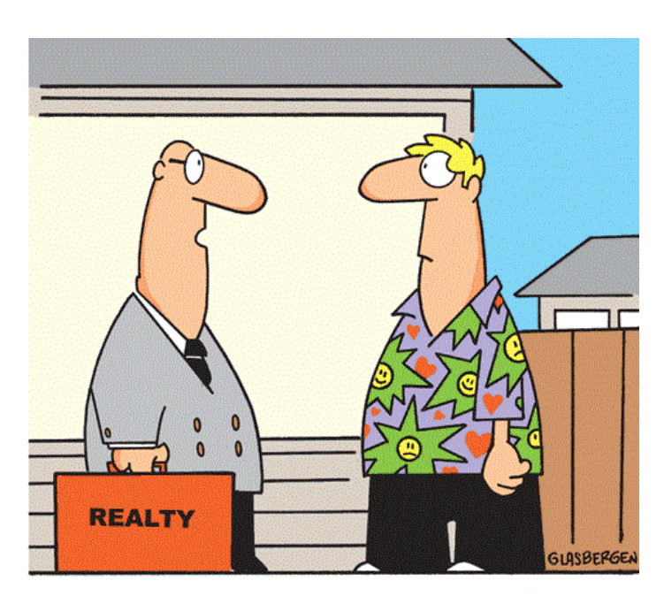
"I think the seller will accept your offer, but the Homeowners Association will never approve that shirt."

<u>Reminder</u> : In Fairfax County, dogs are required to be on a leash at all times in public areas unless they are in a designated off-leash area.